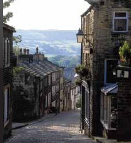
Historic Village of Haworth

The Bronte Parsonage Museum still retains the atmosphere of the Brontes' time. The rooms they once used are filled with their furniture, clothes and personal possessions.