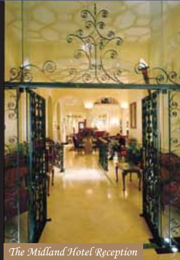
The Midland Hotel Reception