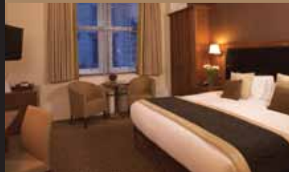
Executive Accommodation, The Midland Hotel