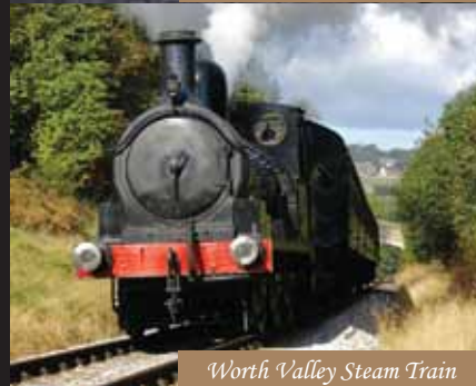
Worth Valley Steam Train