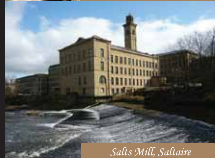
Salts Mill, Saltaire