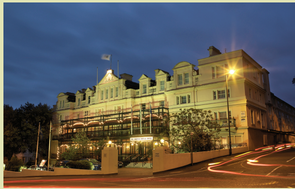
Perfectly positioned in the heart of Bournemouth

In the evenings, the town comes alive with bars, nightclubs, restaurants, shows, and concerts and throughout the year, special events provided by the local authority.