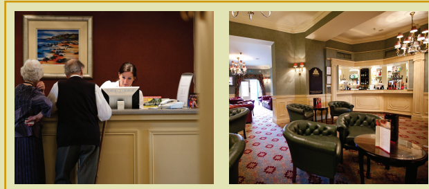
Reception and Lounge Area