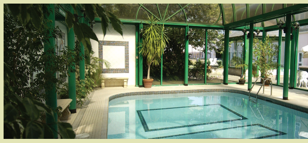
The Glass-Domed, Indoor Heated Pool & Health Club