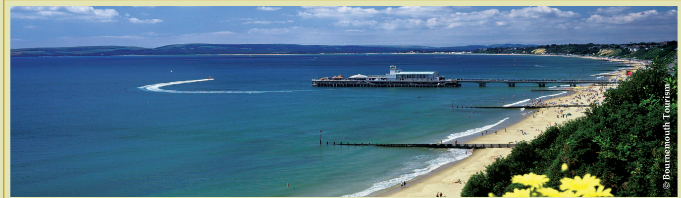
The View of Bournemouth's Beautiful Beach